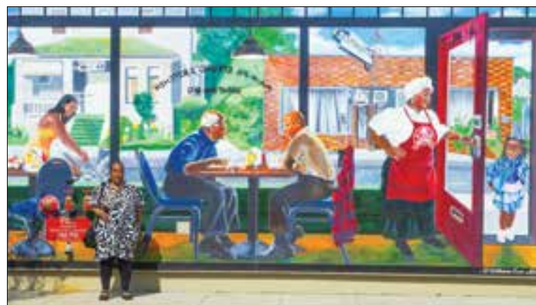
Mural of Strong family business that once stood where the Strong Empowerment Village now stands