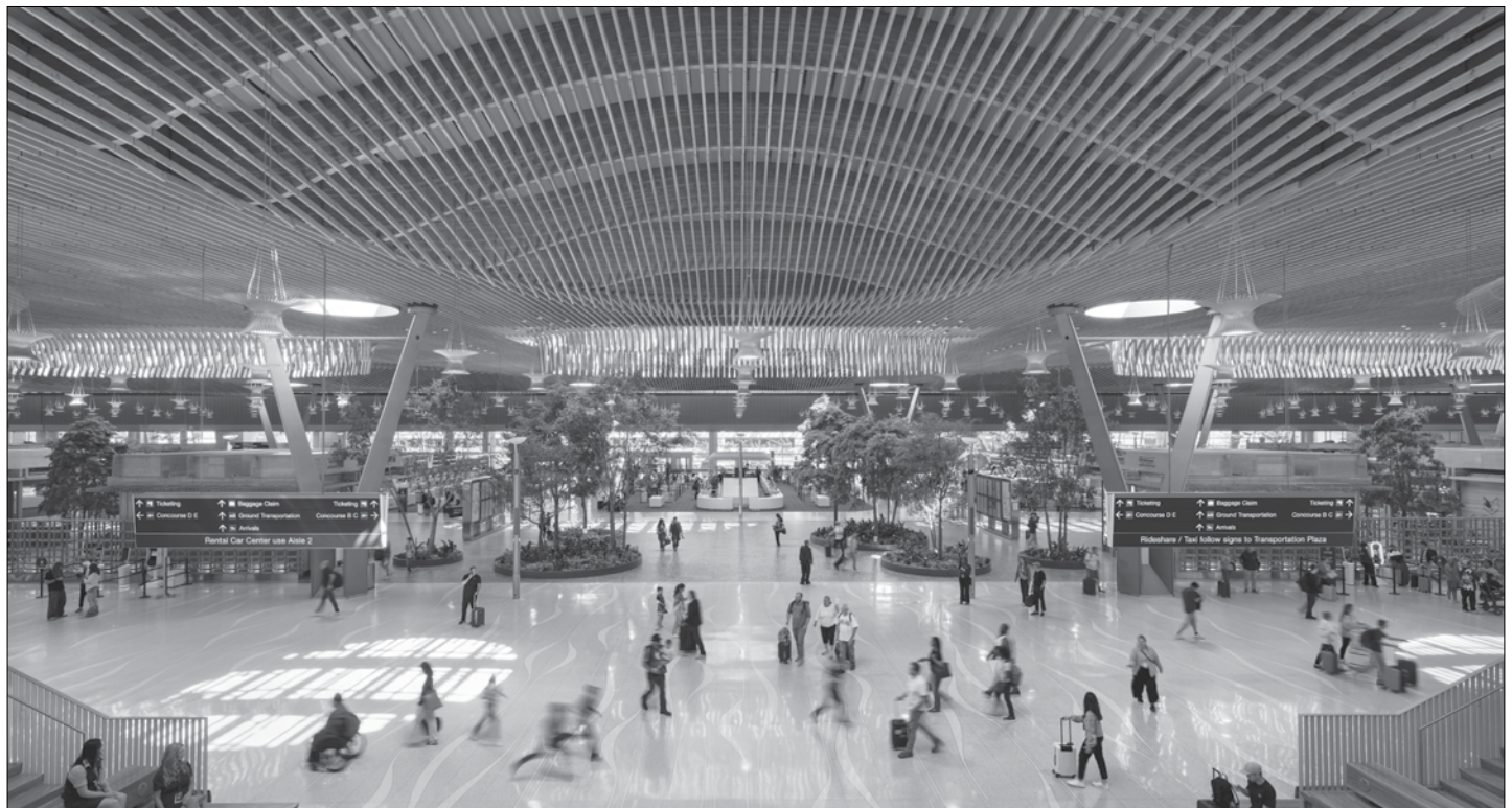
Updated PDX - Main Terminal

“From the beginning, our North Star was a new PDX that reflects our values and the people and places that make this region special,” said Curtis Robinhold,