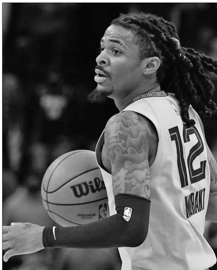
Memphis Grizzlies guard Ja Morant (12) plays in second half of NBA basketball game against the Atlanta Hawks Jan. 21, 2026, in Memphis, Tenn.