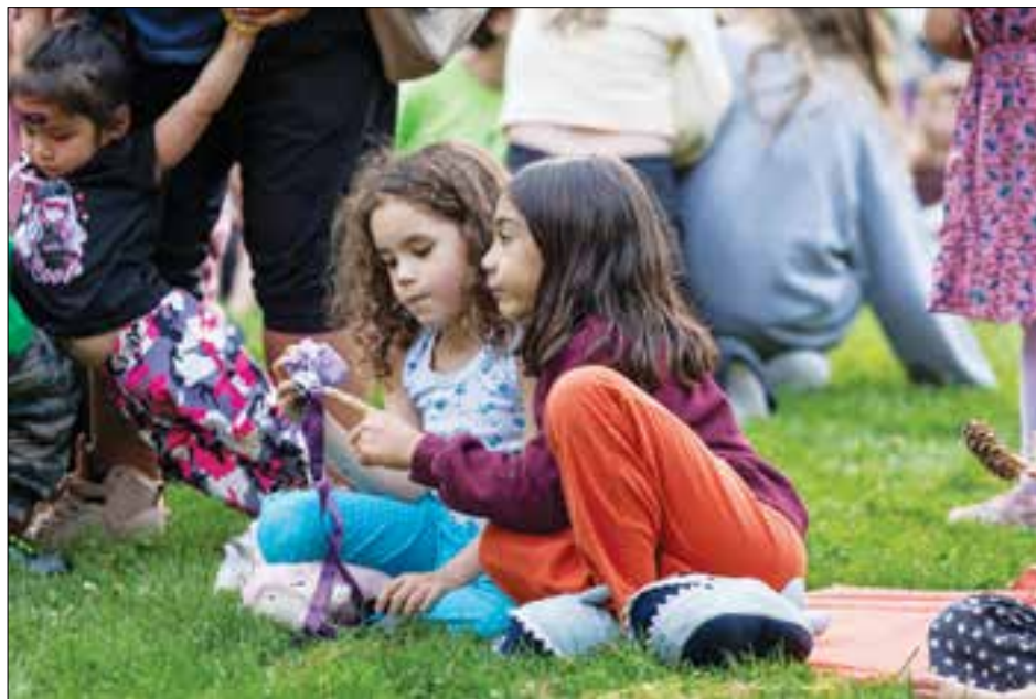
2025 Movies in the Park

More than half of Portland's school-age children qualify for free or reduced-price meals during the school year. PP&R's Free Lunch + Play program offers nutritious meals and fun activities for kids and families when school is out. There are sports,