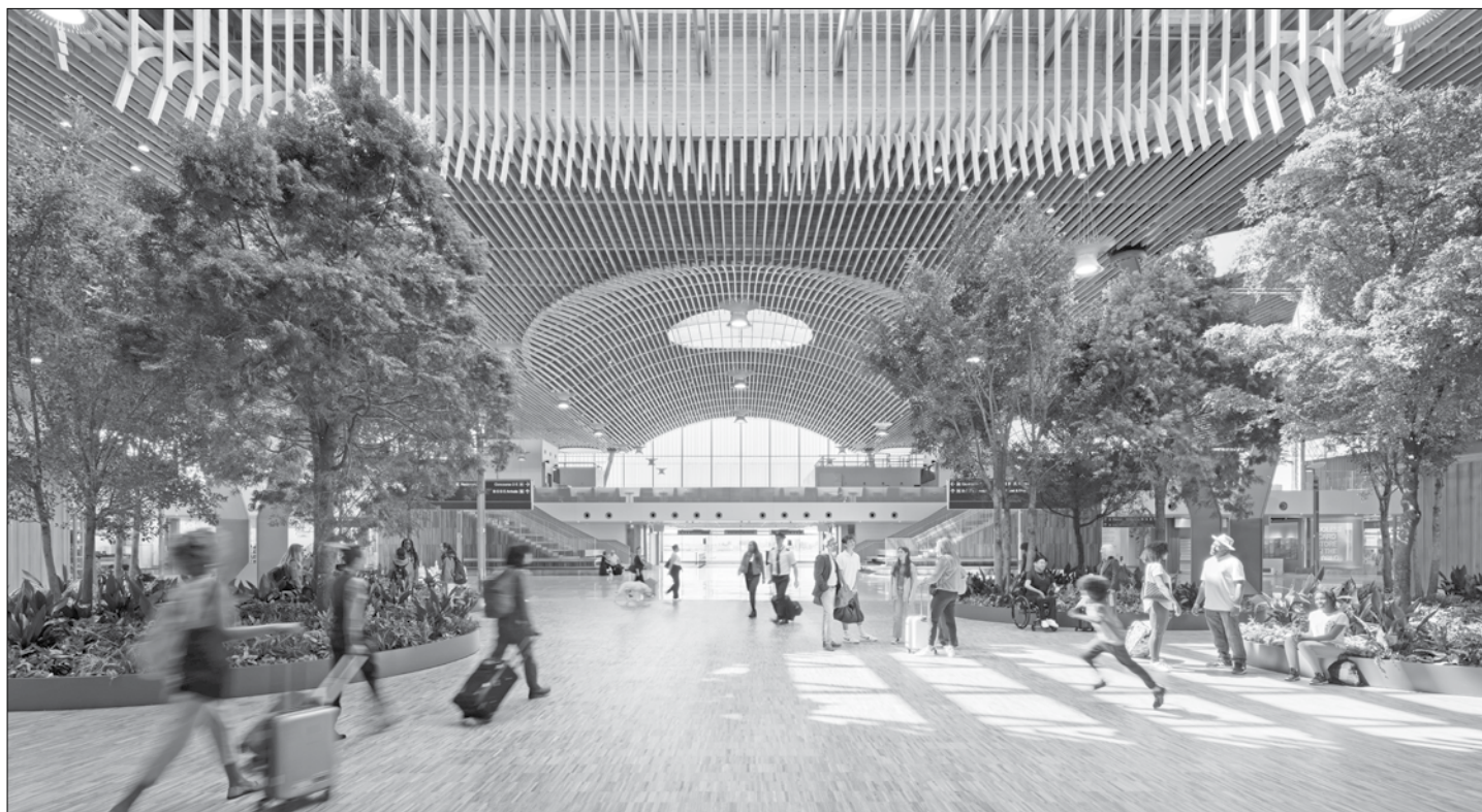
PDX – Garden Area

The new PDX wouldn't have felt complete without the locally beloved retro carpet. The dye colors were adjusted seven times to get the 80s teal carpet fiber just right before installation in several prime locations throughout the new terminal.