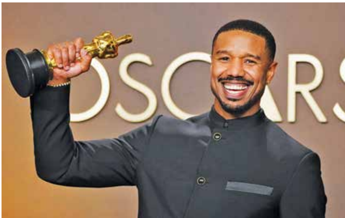
Michael B. Jordan, winner of the award for actor in a leading role for "Sinners," poses in the press room at the Oscars on Sunday, March 15, 2026, at the Dolby Theatre in Los Angeles.

Jordan was cheered loudly as he made his way through the backstage photo and interview rooms. The win is Jordan's first Oscar.