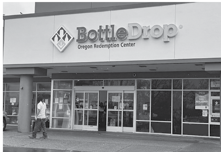
North Portland Bottle Drop Center

“Since 1971, Oregon’s Bottle Bill has delivered outstanding recycling outcomes and positive environmental benefits for com-