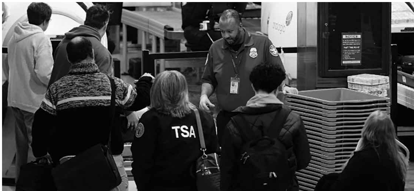
Travelers wait at a TSA security checkpoint at Detroit Metropolitan Wayne County Airport, Nov. 30, 2025, in Romulus, Mich.