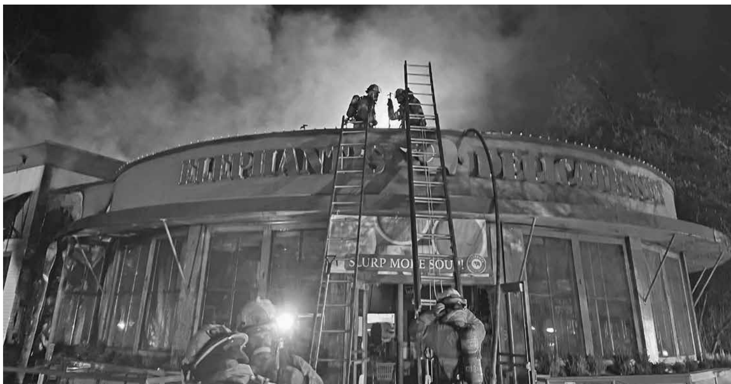
Elephants Deli

Crews were temporarily pulled off the roof with heavy fire pushing out of roof vents 20 minutes into the incident with a concern of switching tactics to a defensive fire attack posture. Radio communication made from the last officer to exit the structure indicating a body of fire was just located and could safely be addressed from both the interior and exterior had command continue permit the offensive