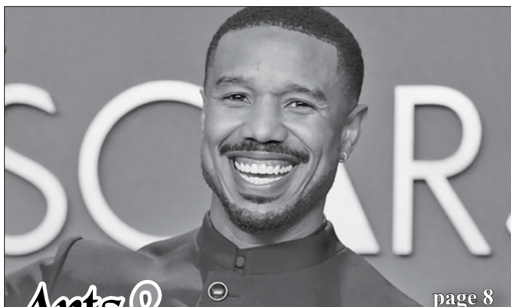
March Madness: How, What to Watch