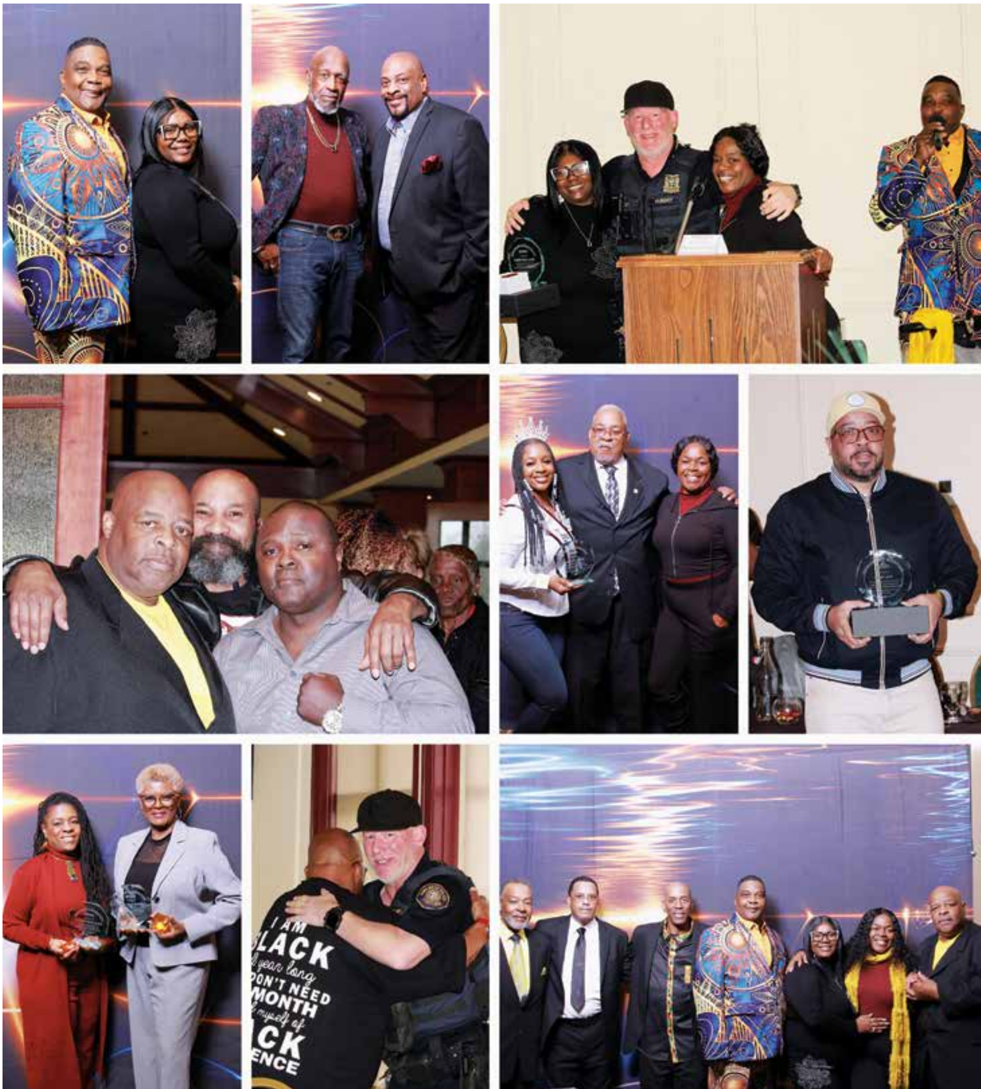
Community members and leaders receive honorable mentions and awards at an unforgettable evening.