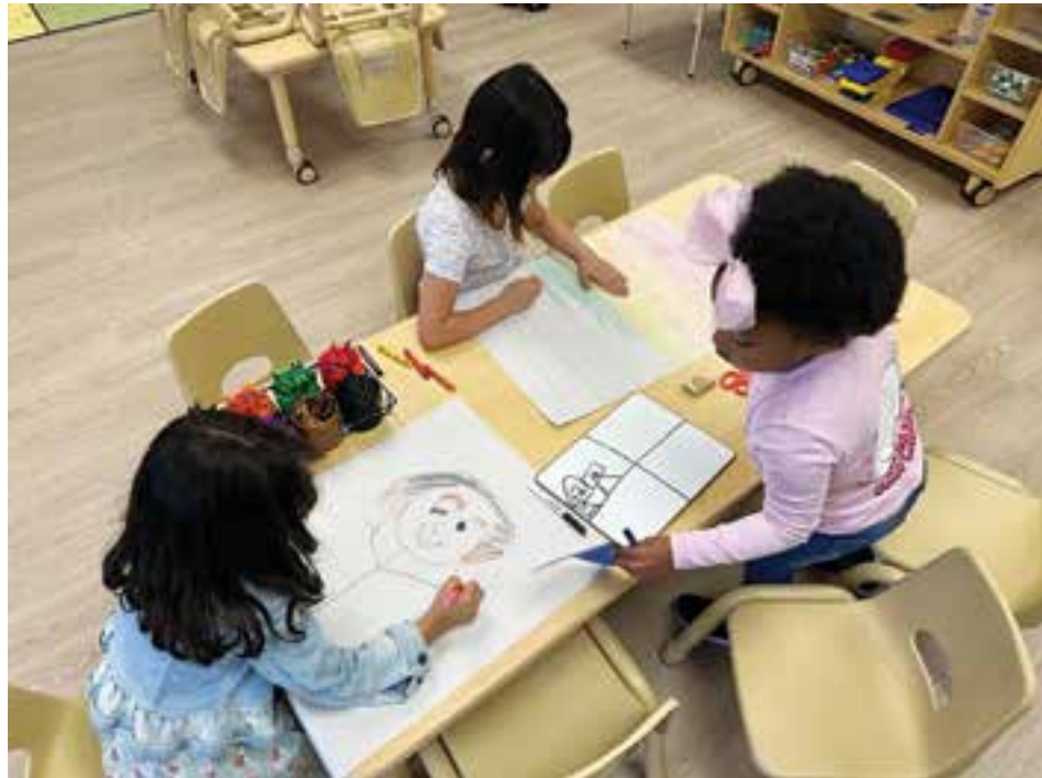
Children draw in one of the classrooms at the Children's Promise Centers child care center in Albuquerque, N.M., April 5, 2024.