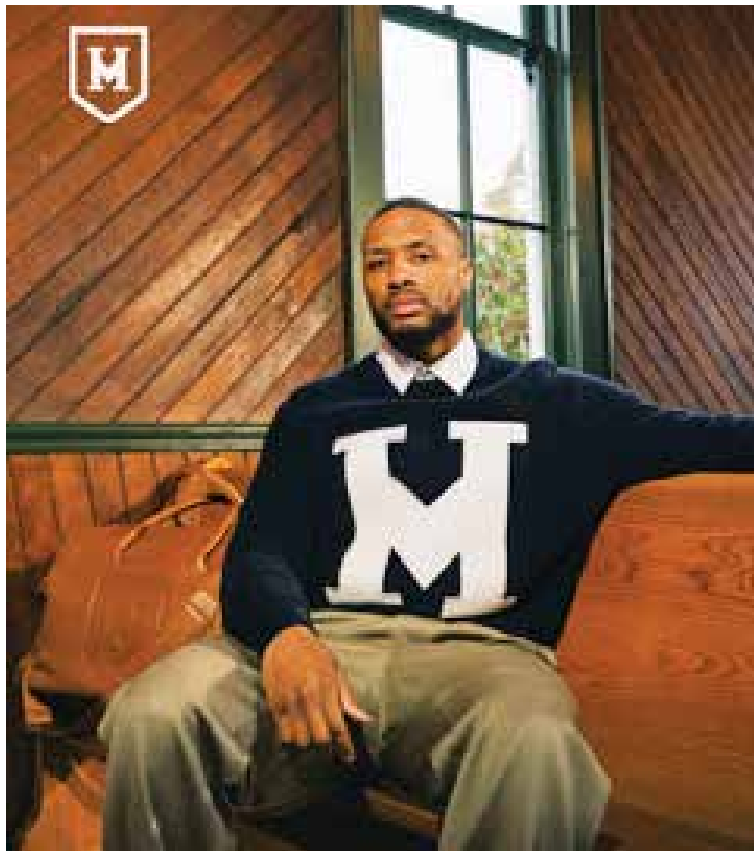
Damian Lillard joins an ownership group to open Honorable Mention, Portland's first luxury sports lounge, inside the Benson Hotel.