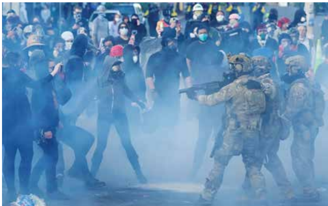
U.S. Customs and Border Protection agent's standoff against demonstrators as tear gas fills the air outside the U.S. Immigration and Customs building during a protest in Portland, Ore., June 14, 2025.

"Plaintiffs provided numerous videos, which were received in ev-