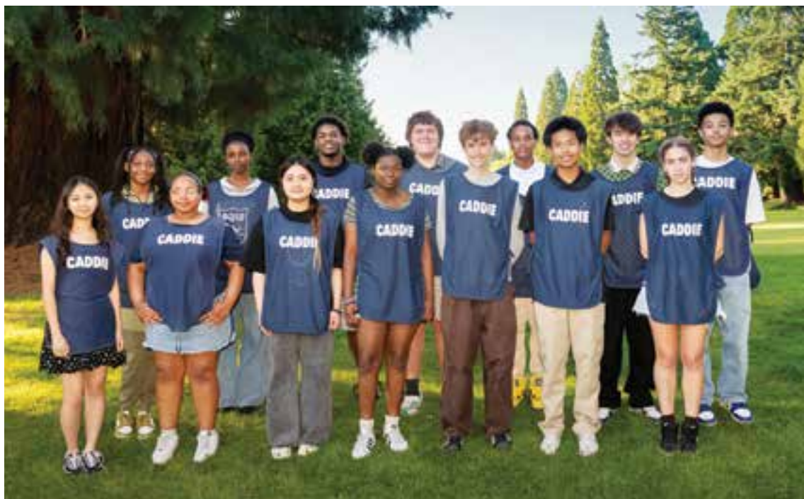
Current EAGLE caddies. Photo taken February 10, 2026, at Waverly Country Club

Portland Parks & Recreation (PP&R) is now accepting applications for the three-year Early Adventures in Golf for a Lifetime of Enjoyment (EAGLE) Caddie Program. This unique program gives current ninth-grade students the chance to gain valuable work experience, earn money over the coming summer, and potentially qualify for a full